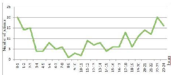
Figure 1: The distribution of patients according to the hours per day

i.v. route in 93.7%). No gender differences were noted in terms of the proportion of patients for whom a poison-center call was made and in terms of the proportion of patients who were given activated charcoal and NAC.